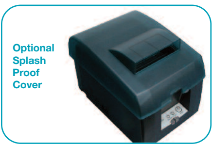
Optional Splash Proof Cover