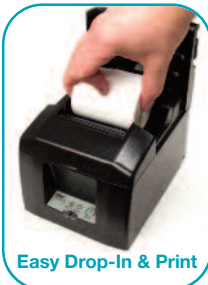
Easy Drop-In & Print